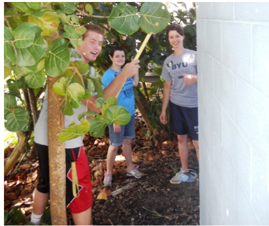
Freshly painted Ocean Park Bathhouse