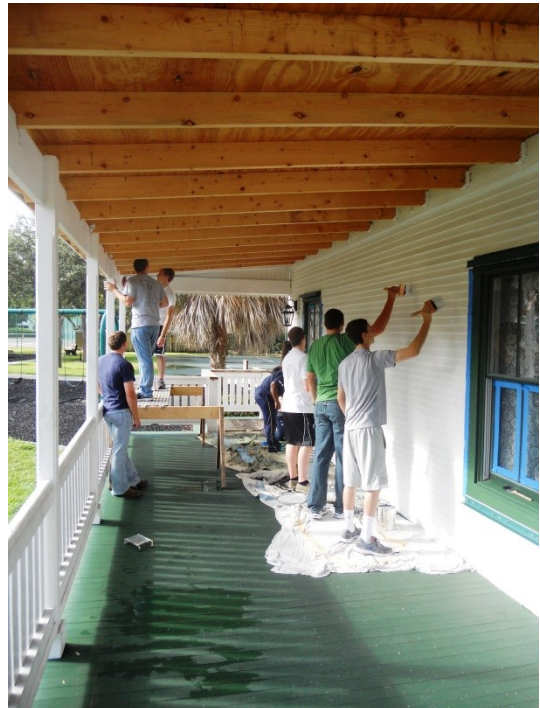
Ryckman House gets fresh paint